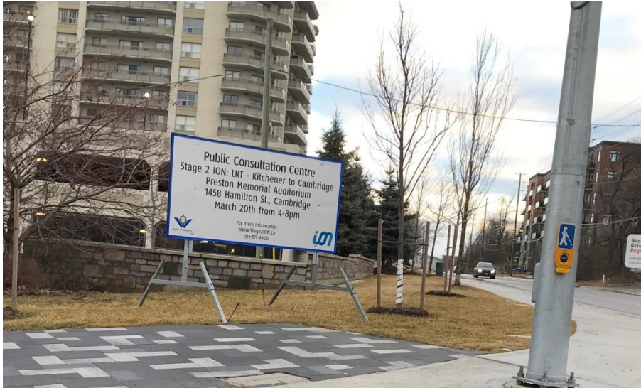
Figure 1: On-Street Advertising

March 11, 2019 and remained in place until March 21, 2019. Figure 1 provides an example of the road signs.