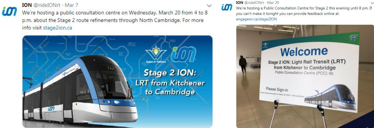
Figure 2: Tweets Announcing PCC No. 4