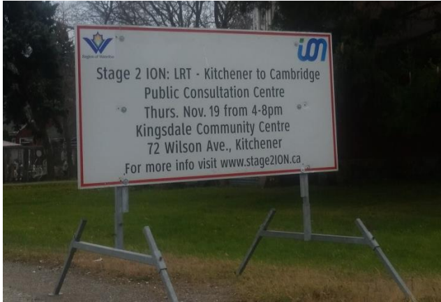
Figure 1-1: On-Street Advertising, City of Kitchener

The road signs were at each location from November 12 through to November 20.