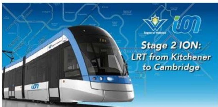
Figure 3: Public Consultation Centre No. 2 Facebook Posting