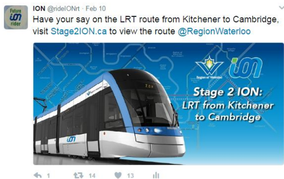
Figure 2: Public Consultation Centre No. 2 Twitter Posting

The Region of Waterloo has a Twitter account for the light rail transit ION project, called @ridelIONrt . Several tweets were posted prior to Public Consultation Centre No. 2, the following are two examples: